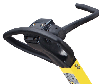
Precise and save to operate BOMAG single lever control