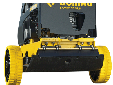
Simple and safe transport Transport wheels (optional)