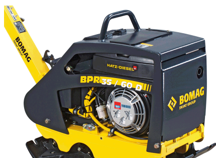
Robust and reliable Best component protection