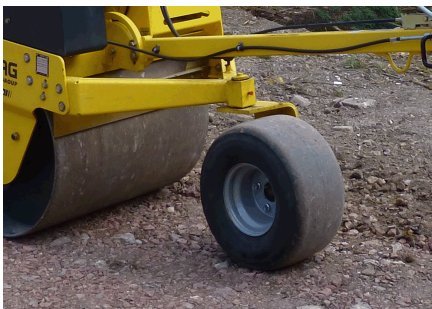
Comfortably to control Wheel set (optional)