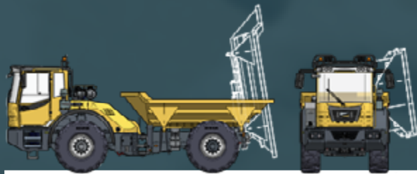
Bergmann 3012 DSK PLUS Three-way dumper

What features do you need for your Bergmann?