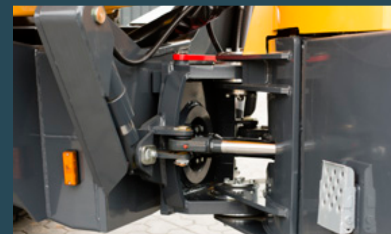
Articulated swivel joint with stabilisation cylinder.

Good access to all maintenance points with the patented hood system.