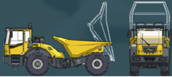
Bergmann 3012 HK PLUS Rear tip dumper