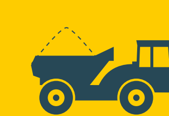
Conventional compact tipper