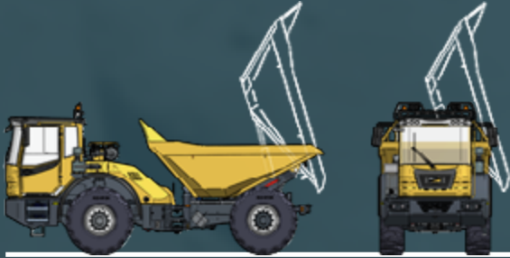
Bergmann 3012 R PLUS Swivel-tip dumper

Packs in 12 tonnes, regardless of the type of bucket used.